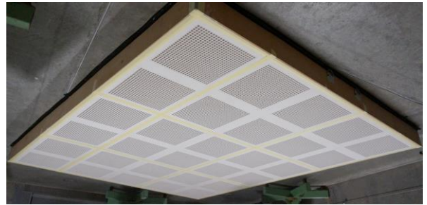
Test specimen installed for testing (image inverted to depict ceiling installation)