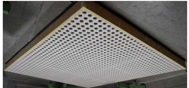
Test specimen installed for testing (image inverted to depict ceiling installation)