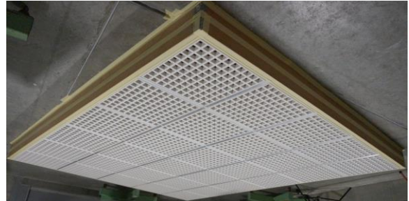
Test specimen installed for testing (image inverted to depict ceiling installation)