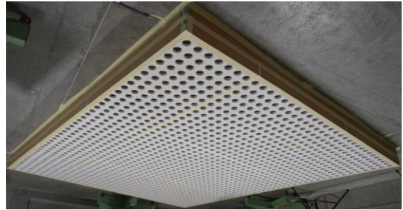
Test specimen installed for testing (image inverted to depict ceiling installation)