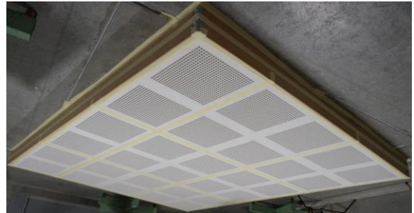
Test specimen installed for testing (image inverted to depict ceiling installation)