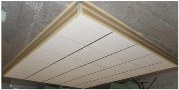
Test specimen installed for testing (image inverted to depict ceiling installation)

Tile Details 3 • Moulded plaster ceiling tiles designed to drop into a standard 600 mm suspended ceiling grid. • Perforated with a regular pattern of 1849 circular holes (43 x 43 array), of which 2 lines around the perimeter were not open at the rear, and the remainder (39 x 39) opened into the glass fibre batt behind. Hole size was approx 7 mm at the face, tapering to 6.5 mm at the rear, positioned at approx 13 mm spacing. • Decorative effect of perforations was supplemented by additional moulding details (grooves in the tile face between the perforations, and varying height of facets in between as per photo). • Open area percentage 4 (estimated): 19.8 % (based on mouth area of all 1849 holes); 14.0 % (based on throat area at rear of holes, of only those holes opening into the fibre batt behind). • Each tile was fitted with a semi rigid high-density CSR Bradford glass fibre batt, 500 x 500 x 20 mm (approx 42 kg/m 3 ); installed during production of the tile, fixed in place by way of plaster skim-coat around the perimeter of the batt; the majority of the batt remaining open and exposed to the cavity.