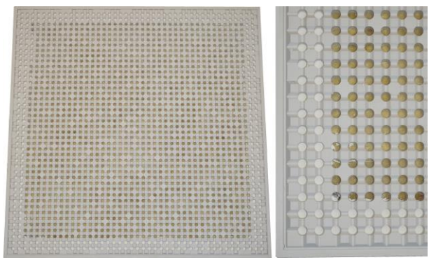
Tile details – Left: whole tile, Right: close-up view

Installation • The test specimen was installed as an upside-down ceiling on the floor of the chamber. • A 200 mm deep enclosure (32 mm MDF timber, approx 23 kg/m 2 , built to surround an area of 3600 x 3000 mm) was placed on the floor of the chamber at an 11° angle to the chamber walls (not parallel, as per AS ISO 354 cl6.2.1.2). The enclosure consisted of two 100 mm deep modules, stacked to create the E-200 enclosure. The junctions of the enclosure modules to each other, to the floor, and to the tile array were all taped. • A system of plastic support feet sitting on aluminium extrusions (upside-down Tees) was set up inside the enclosure to support the tiles with their exposed face nominally flush with the enclosure. The cavity behind was a single undivided cavity without internal partitions. • Tiles were arranged in a 6 x 5 array on the support system, then a full grid of main and cross tees was placed on top to cover the gaps between the tiles, matching a normal ceiling installation. • Specimen installation was carried out by laboratory staff.