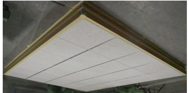
Test specimen installed for testing (image inverted to depict ceiling installation)