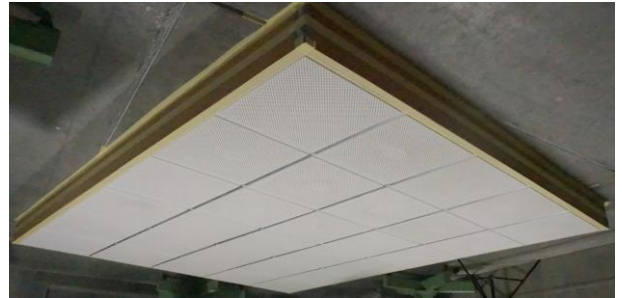
Test specimen installed for testing (image inverted to depict ceiling installation)